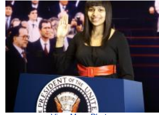
View More Photos